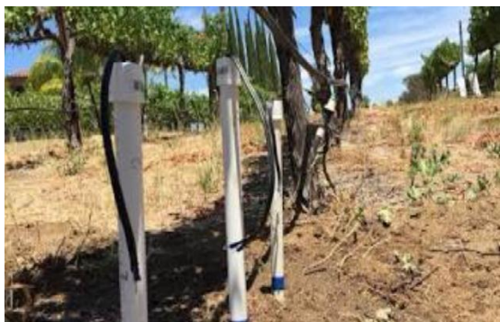
Figure 2 Installation of Sensor nodes on-site using metal rods and screws

these nodes are fixed on the metal rod for easy installation on the ground of the site using screws. The nodes can also be installed at the deep depth of the ground for vibration measurement if any. The nodes placed on-site have two parts, one above the ground for monitoring dust and noise emission and another placed within the ground mounted on same rod called acceleration sensor for monitoring vibrations caused by tools used for construction and demolition of building.