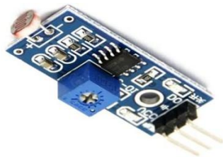
Figure 3: 16x2 LCD display

communication systems like Li-Fi. In a Li-Fi receiver circuit, the LDR acts as a light sensor that detects the rapid variations in light intensity coming from the transmitting LED. These changes in light are converted into corresponding electrical signals, which can then be processed by an amplifier or microcontroller to recover the original data. Thus, the LDR plays an important role in converting optical signals into usable electrical information.