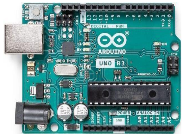
Figure 2: Arduino Uno

Arduino Uno is an open-source microcontroller board based on the ATmega328P microchip. It features 14 digital input/output pins, 6 analog inputs, a 16 MHz quartz crystal, a USB connection, and a power jack. The board is widely used in embedded system applications for prototyping, automation, and robotics due to its simplicity, low cost, and compatibility with the Arduino Integrated Development Environment (IDE) for easy programming and debugging.