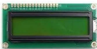
Figure 4: 16x2 LCD display

A 16x2 LCD display is an electronic screen that can show 16 characters per line and has 2 lines, which is why it is called "16x2." It is one of the most commonly used displays in electronic projects because it is easy to interface with microcontrollers like Arduino, PIC, or Raspberry Pi. The display uses Liquid Crystal Display (LCD) technology, where liquid crystals change their orientation when electricity is applied, allowing characters to appear on the screen. A 16x2 LCD usually works.