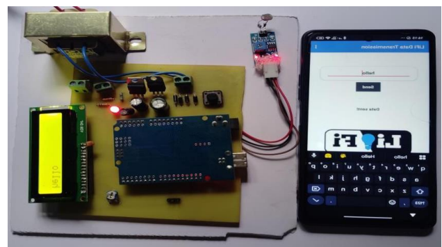
Figure 5: LED

The Light Fidelity (Li-Fi) communication system was successfully designed and tested under indoor conditions. The system effectively transmitted data using visible light from a high-brightness LED, and the receiver accurately detected the modulated light signal using a photodiode. The received signal was amplified and processed to reproduce the original information with minimal distortion. Experimental results showed stable and reliable data transmission within a limited line-of-sight range. The system performed efficiently in environments where radio frequency interference is present or restricted. It also demonstrated improved security, as the transmitted data remained confined to the illuminated area. The overall performance confirms that Li-Fi can serve as an effective alternative to traditional wireless communication for short-range indoor applications. The results validate the feasibility, simplicity, and practical usefulness of Li-Fi technology in modern communication systems.