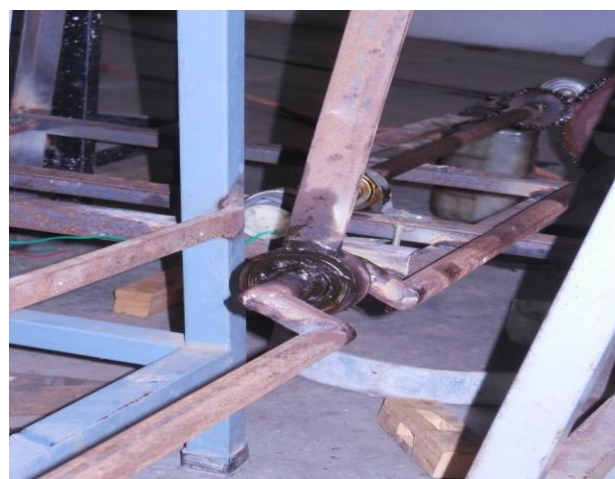
Figure 2.5 Crank Shaft

Diameter of the cross section of crankshaft = 20 mm. Length of the crankshaft = 2100 mm. Length of the bend = 50 mm. Height of the bend = 30 m