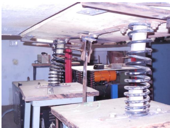
Figure 2.4: Helical Springs

Helical Springs used in this system are directly welded to a steel strip which is bolted or fastened tightly to the speed breaker.