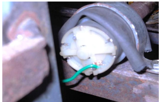
Figure 2.9: Generator