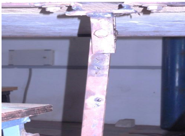
Figure 2.3: Connecting Rod

A connecting rod is an engine component that transfers motion from the piston to the crankshaft and functions as a lever arm. The connecting rod in this system also serves the same purpose. Together with the crankshaft, it forms a simple mechanism that converts reciprocating motion into rotating motion.