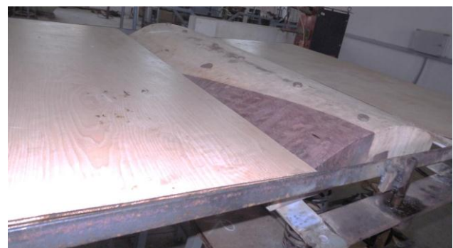
Figure 2.2: Speed Breaker (Dimensions of Speed Breaker Cross Section: 1.2 × 3 feet, Length: 3 feet)

Speed Breaker is used to transmit the pressure exerted by the vehicle on the connecting linkages, thereby producing mechanical movement in the connecting rod.