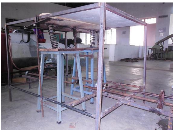
Figure 3.2: Assembled Model of Speed Breaker Power Generation System

The figure below shows the photograph of the assembled