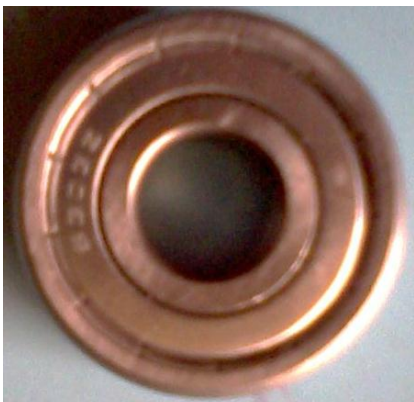
Figure 2.8: Ball Bearings

A bearing is a machine element that constrains relative motion and reduces friction between moving parts to only the desired motion. The design of the bearing may, for example, provide for free linear movement of the moving part or for free rotation around a fixed axis; or, it may prevent a motion by controlling the vectors of normal forces that bear on the moving parts. Many bearings also facilitate the desired motion as much as possible, such as by minimizing friction. Bearings used here are Ball Bearings and are mounted on the crank shaft for connecting the connecting rod.