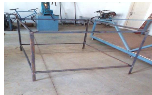
Figure 2.1: Frame of the table (Dimensions of the table: 3×3×4 feet)