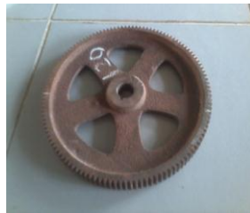
Figure 2.6: Pinion